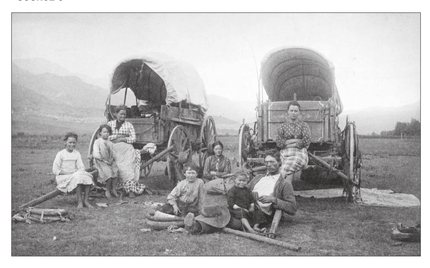
An emigrant family photographed by their wagons as they traveled along the Oregon Trail in the late 1860s.