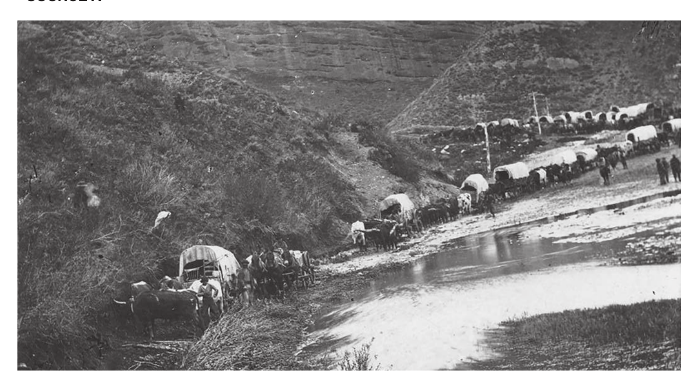
Emigrants in a wagon train struggling through muddy conditions in Echo Canyon, Utah, as they traveled along the California Trail in 1866.