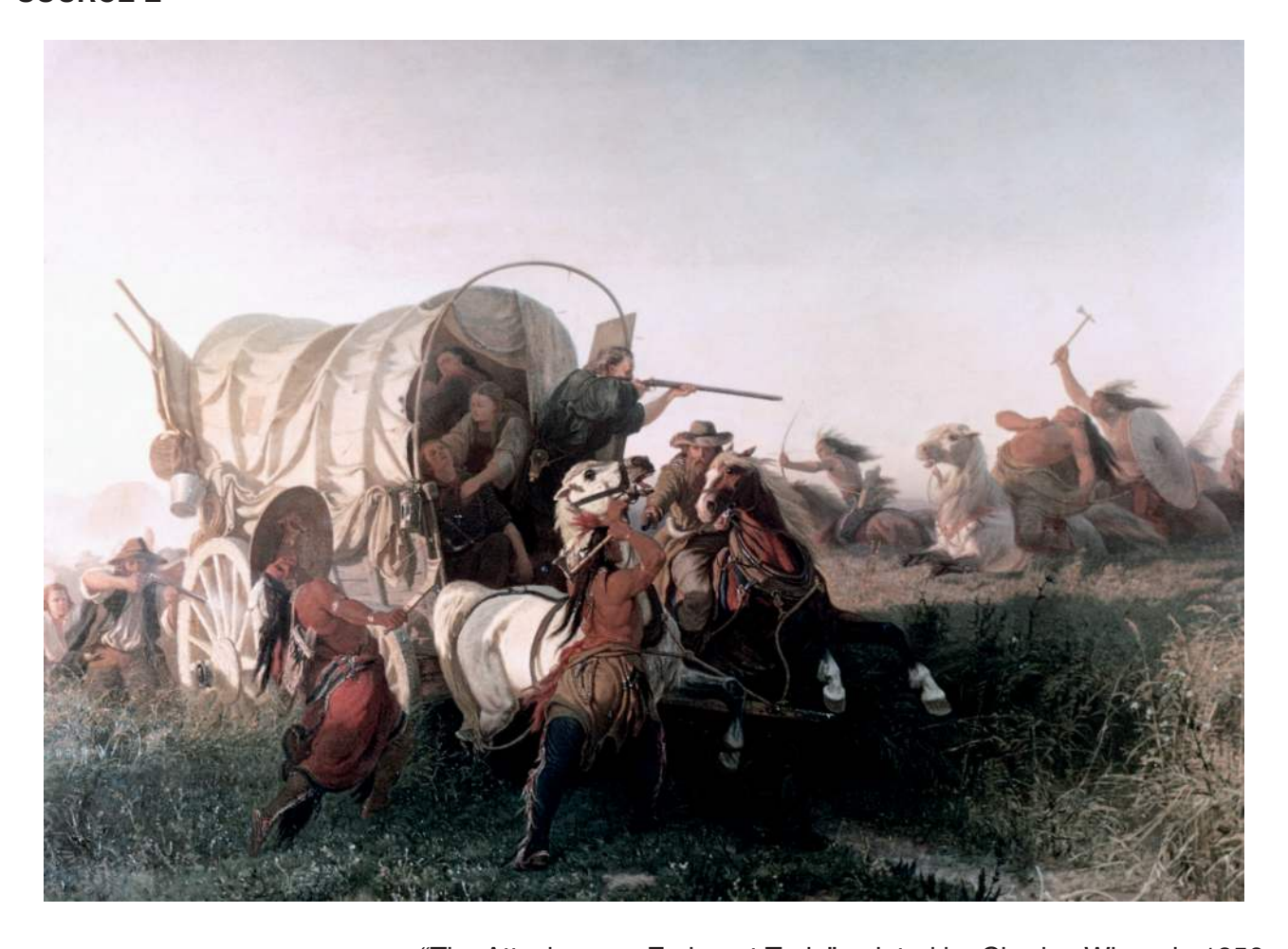
"The Attack on an Emigrant Train" painted by Charles Wimar in 1856. Wimar painted this scene after hearing stories of wagon trains being attacked by Native Americans during their journey to California in 1849.